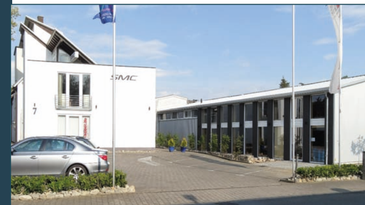
One of our 17 offices and meeting rooms

Our company building in Münster and our conference center SMC right next door